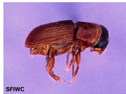
Southern Pine Beetle (Dendroctonus frontalis)

female bores through the bark she excavates a characteristic tunnel called a gallery and lays eggs in niches along the sides. Larvae feed by chewing and excavate their own galleries at right angles to the main gallery. Mature larvae pupate in an enlarged cell at the end of their feeding tunnels. Adults emerge and chew through the bark to the tree's surface. This process may take weeks or months. Depending on the species, there may be one or several generations per year. Adult bark beetles may be present from spring through fall.