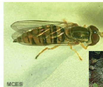
Flower fly adult and larva