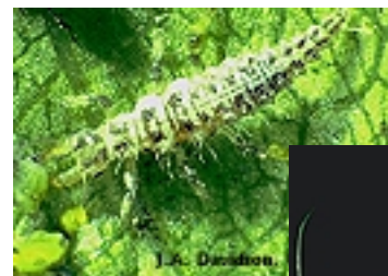
Lacewing larva and adult