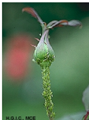
Aphids on rose