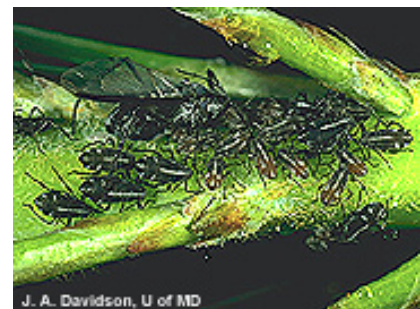
White pine aphids