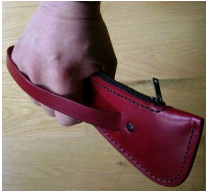
Todd Foster Coin Sap

Perrin's. If I can see that a street cop may also pick up on that. You are going to have to determine if carrying either of these items is legal in your jurisdiction.