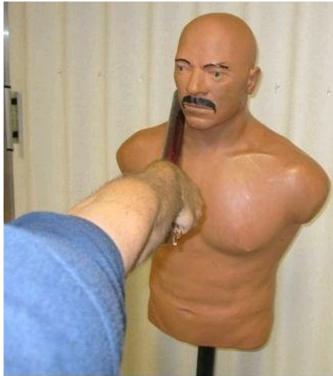
Backhand Downward Diagonal

The backhand downward diagonal strike is similar only this starts on from your weak side or backhand.