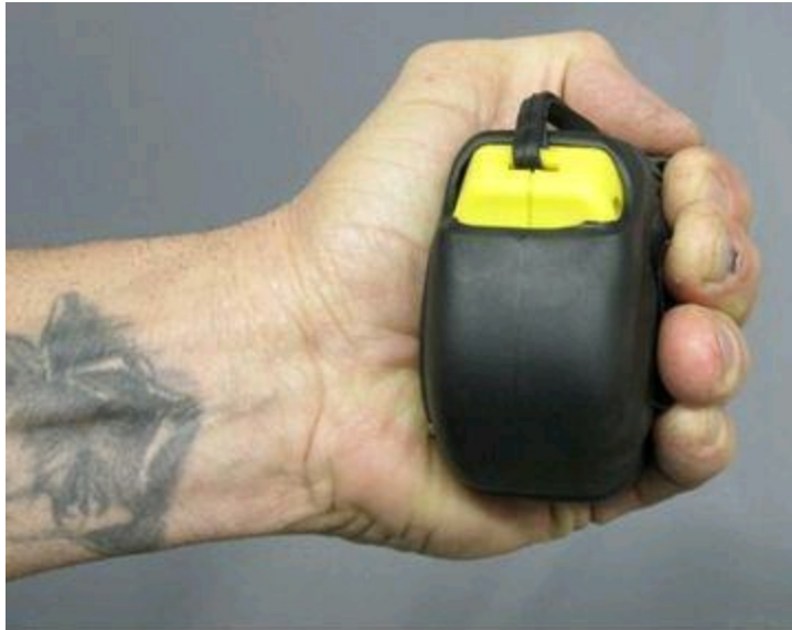
Strike with Edge of Tape

The second way is by turning the tape in your hand slightly and striking with the edge. Here your force will be more concentrated than striking with the wider side. The first example is more like striking with a punch. The second example is more like a knuckle punch where the force is concentrated into a smaller area. This is more likely to break bones and cause a knockout.