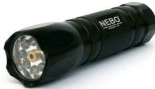
NEBO Model 5077

has three light settings. The first is the white light, the next is the strong red laser light, and the next gives you a strobe. There is also a repeating S.O.S signal setting. The bezel has semi-blunt edges designed to some serious damage when used for striking. The price is in the $15 range, cheap enough so you can have one with you all the time. If you lose it, no big deal.