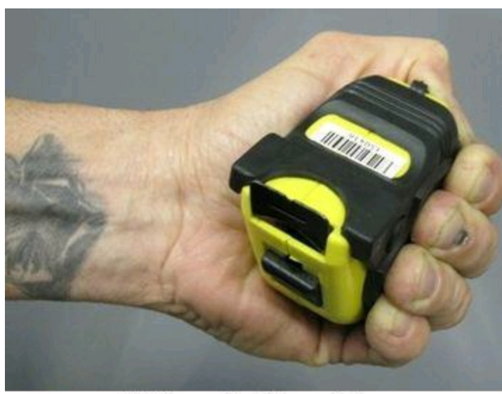
Strike with Sharp Edge