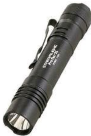
Streamlight ProTac 2L Professional Tactical

If you think $150 is a bit much for a tactical flashlight, you've got some cheaper options. Streamlight makes quality flashlights. They've also entered the world of tactical flashlights for civilian use. Streamlight ProTac 2L Professional Tactical puts out 180 lumens on high and has high, low and strobe modes. Press once and you've got high beam, which you want for a tactical light, in my opinion. If you are going to use it for distracting or blinding, you want the first light that comes on to be the high beam. This one runs in the $50 range.