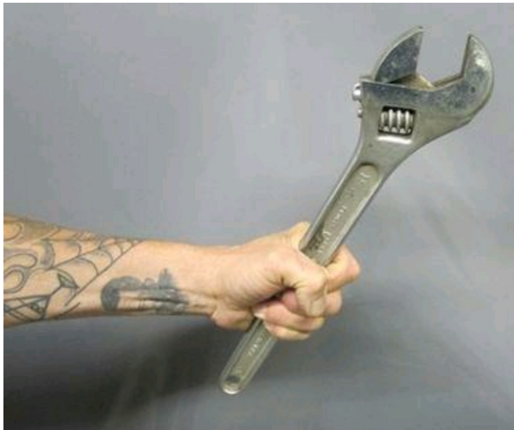
One Hand Hammer Grip

One Hand Hammer Grip: Just what the name implies. Grab it just like you are going to pound nails with a hammer. Ideally you'll want to "choke up" and leave one hand grip length exposed on the bottom. You'll use that end, the pommel, for additional strikes, hooks and blocks. With this grip you'll be able to use the tip and bar for strikes, as well as the pommel to give you more options. Watch a hockey player as he goes into the corner after a puck. He'll use the "butt end" (pommel) of his stick, to jab the opposing player. The penalty is called "butt ending." It's a dirty trick, but it works.