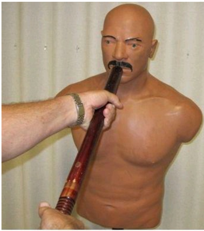
Thrust – Bayonet Grip

The cross body is also delivered with a two-handed bayonet grip, but instead of striking with the tip, you are striking with the bar, more of the style of a hockey player delivering a cross check.