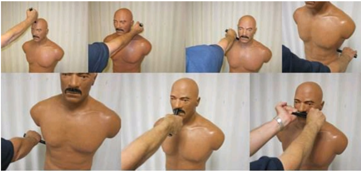
Angles Shown Using Short Impact Weapon