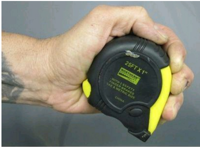
Strike with Flat Side of Tape

The second way is by turning the tape in your hand slightly and striking with the edge. Here your force will be more concentrated than striking with the wider side. The first example is more like striking with a punch. The second example is more like a knuckle punch where the force is concentrated into a smaller area. This is more likely to break bones and cause a knockout.