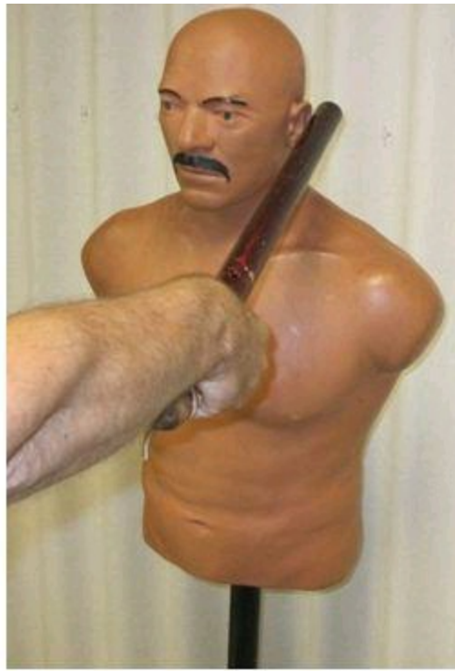
Strong Side Downward Diagonal

The backhand downward diagonal strike is similar only this starts on from your weak side or backhand.