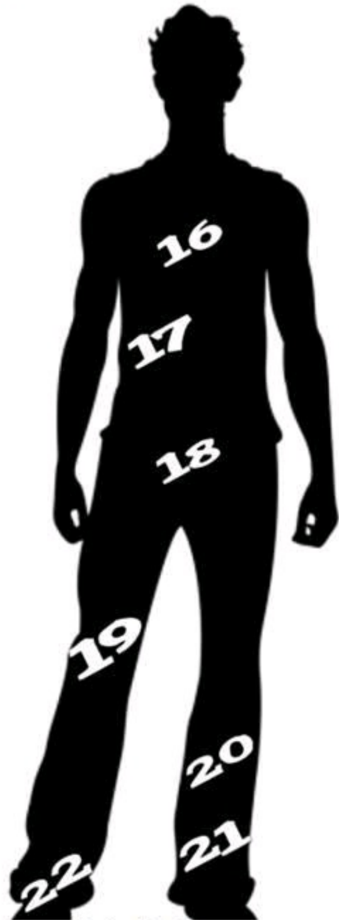
Back of Body