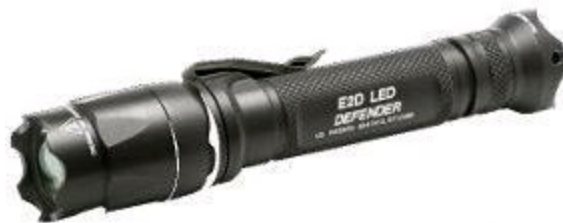
SureFire E2D LED Defender

If you have the dough, you can look at the SureFire Defender . For one thing, it's bright. It cranks out 200 lumens on high beam. Just shining the light in your attacker's eyes may temporarily blind him enough for you to escape or launch a counter attack. And this light is designed to be used as a defensive weapon. The crenellated striking bezel and scalloped tailcap are both designed to be more effective when used as an impact weapon. At just under 5.5" you're not going to be able to strike with it like you would a 26" flashlight. But you will be able to generate some real impact holding it in your fist and delivering concentrated hammer fist strikes with either the bezel or tailcap. First you blind him, and then you knock a piece off his head.