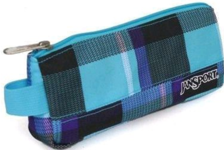
JanSport Pencil Case JTMS9

What is this item? It's an adult pencil case. JanSport makes a model JTMS9, which is basically a zippered case. It is 9 x 22 x 3.5 centimeters. Hanging from your belt it will look like a glasses case. Load that sucker up with coins or anything heavy. You'll look like a pansy but you'll hit like a brick.