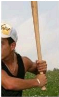
Baseball Bat Grip

Two Hand Baseball Bat Grip: This is more suited to longer weapons, such as a baseball bat, 2 x 4 piece of lumber, or length of pipe. You'll be able to generate maximum power with this two handed grip. The trade-off is you are more limited in flexibility. It may be easy for your opponent to get inside and jam your swing.