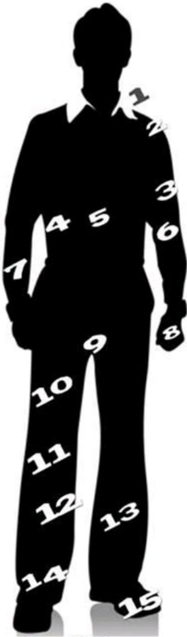
Front of Body